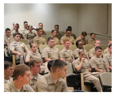
BATTALION PREPARING FOR COMPANY BREAKOUTS