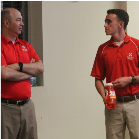
BATTALION COMMANDER AND COMMANDING OFFICER PLAN

Throughout the lab, the battalion reviewed many of the policies and general housekeeping items to get