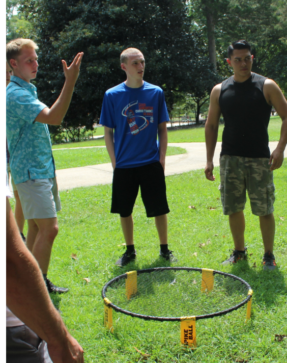
VARIOUS MIDN DISCUSS THE COMPLEX RULES OF SPIKE BALL

Following the speeches from leadership, the Battalion then began the picnic which included burgers, hot dogs, chips and more outdoor style foods. Once everyone was done